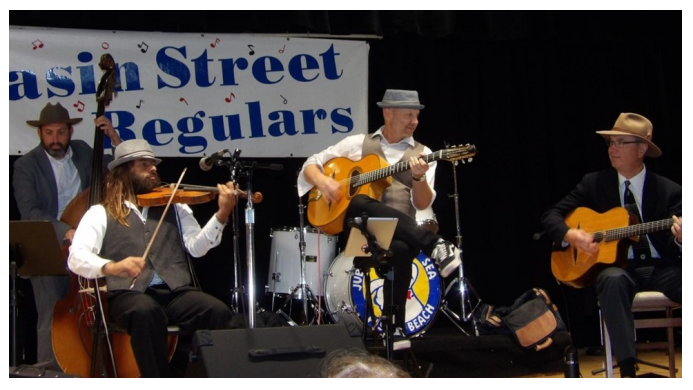
Featured Band: Big Sirs of Swing

Big Sirs of Swing from San Luis Obispo and the AGHS Eagle Jazz Band from Arroyo Grande will be playing "Hot Swingin' Jazz" at the Basin Street Regulars' January Concert from 12:30 to 4:00 on Sunday February 23rd at the Pismo Beach Veteran's Building, 390 Bello Street in Pismo Beach. We will have a jam session starting at 11:00 a.m. Bring your instrument and join in. Jammers pay $5.00 and must sign in at the door. Admission is now $10 members, $15 Nonmembers. Buy memberships at the event! Food and drinks and a BIG WOODEN DANCE FLOOR are available. Tickets available online at: My805tix.com